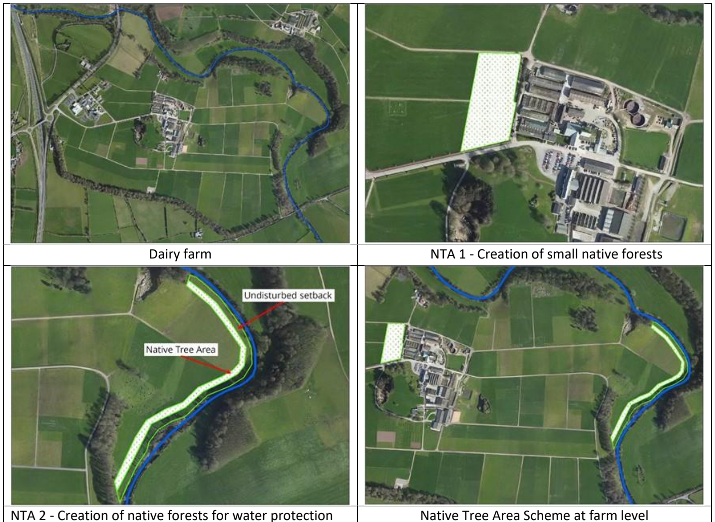
Figure 2. Native Tree Area Scheme example.